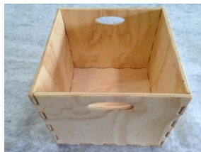
The finished item.

Finally, stand the item so it is ready to accept the final piece. Using the mallet tap into place starting at one corner and progressing around the panel until properly clicked home.